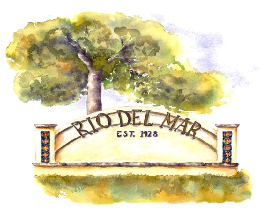
Proposed Sign to be located on traffic median strip opposite Deer Park Center.