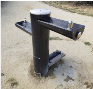
EXAMPLE OF FAUCET DESIGN

The new water faucet is scheduled to be installed this summer. In addition to the water faucet, SC Parks has committed to repairing the broken sidewalk along the grass area leading to the playground. We will keep you posted on progress and announce when the work is complete.